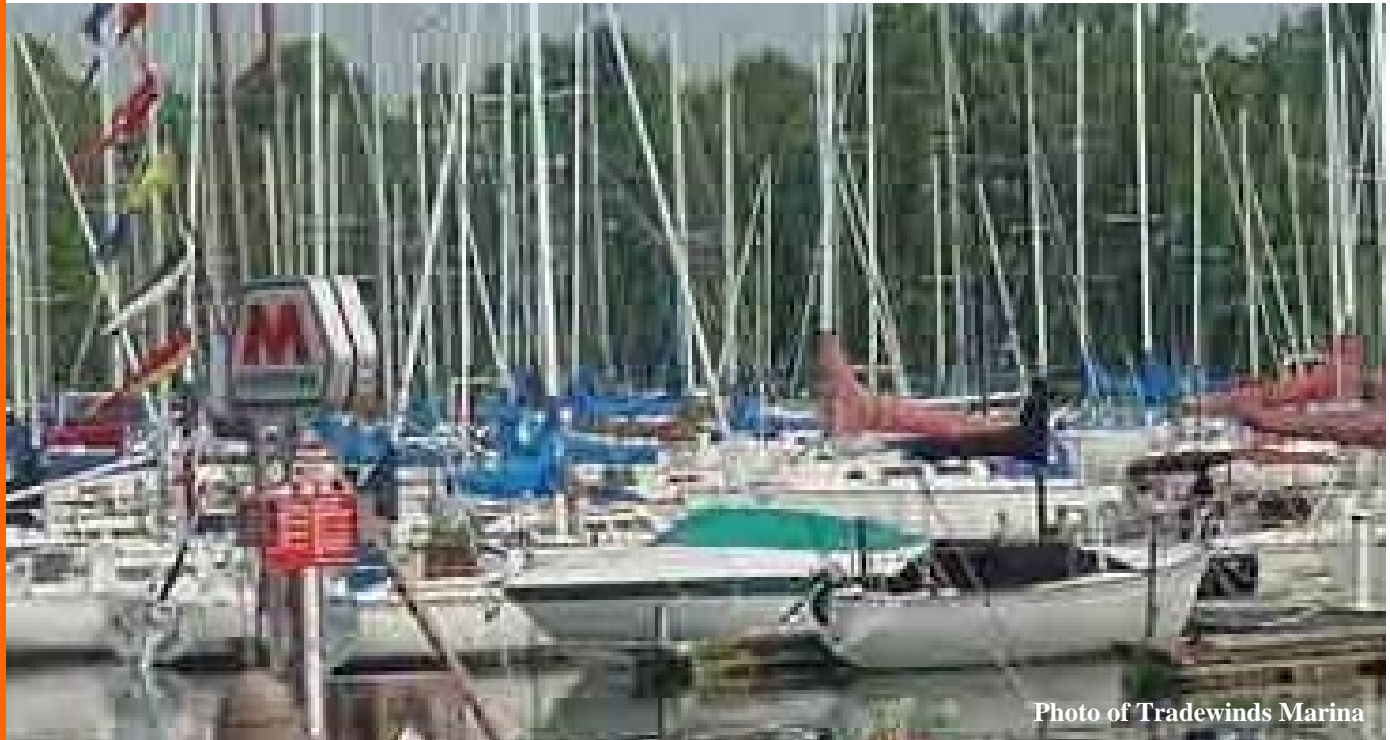
Photo of Tradewinds Marina

100 Mulberry Grove Road (Hwy 10) Keyesport, IL 62253